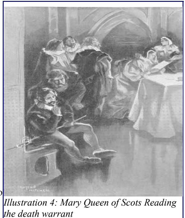
Illustration 4: Mary Queen of Scots Reading the death warrant

She, feeling sure that her time was now come, wrote a letter to the Queen of England, making three