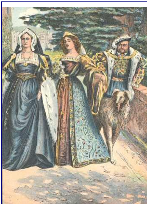
Illustration 3: Catherine was old, so he fell in love with Anne Boleyn

The King and the Cardinal were mightily indignant at this presumption; and the King (with the help of SIR THOMAS MORE, a wise man, whom he afterwards repaid by striking off his head) even wrote a book about it, with which the Pope was so well pleased that he gave the King the title of Defender of the Faith. The King and the Cardinal also issued flaming warnings to the people not to read Luther's