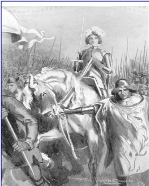
Illustration 2: Joan of Arc

Joan and her two squires rode on and on, until they came to Chinon, where she was, after some doubt, admitted into the Dauphin's presence. Picking him out immediately from all his court, she told him that she came commanded by Heaven to subdue his enemies and conduct him to his coronation at Rheims. She also told him (or he pretended so afterwards, to make the greater impression upon his soldiers) a number of his secrets known only to himself, and, furthermore, she said there was an old, old sword in the cathedral of Saint Catherine at Fierbois, marked with five old crosses on the blade, which Saint Catherine had ordered her to wear.